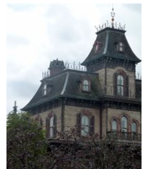
Haunted House Adventure