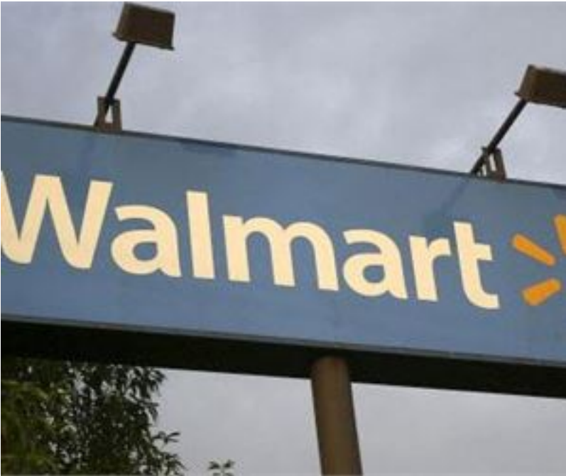
Walmart Apologizes After Advertising Guns As 'Back To School' Item