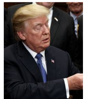
Trump to Send Americans to the M