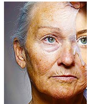
Southampton Gran Shocks Doctors Do This Once Daily