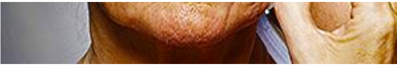
Southampton Gran Shocks Doctors: Forget Botox, Do This Once Daily