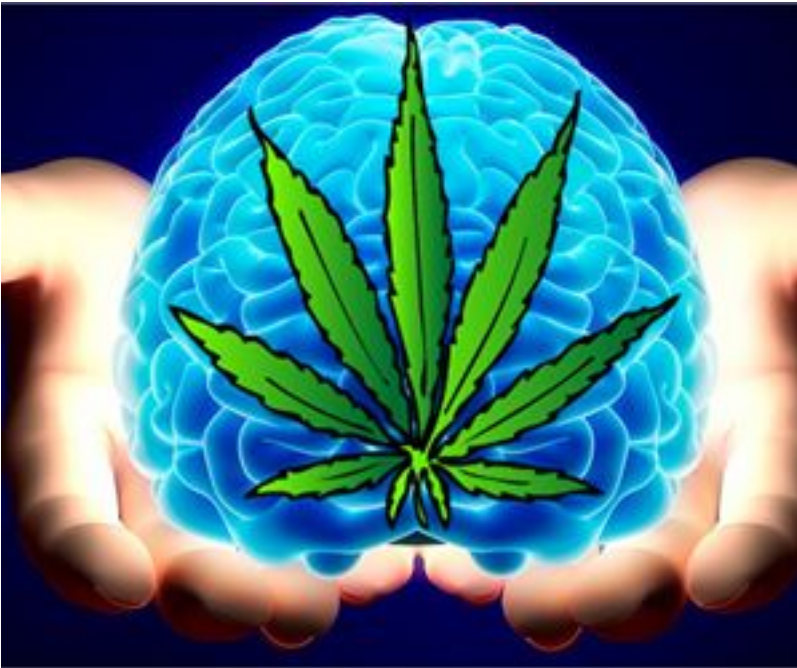
Does Smoking Weed Make You More Creative?