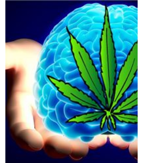
Does Smoking Weed Make You Mo