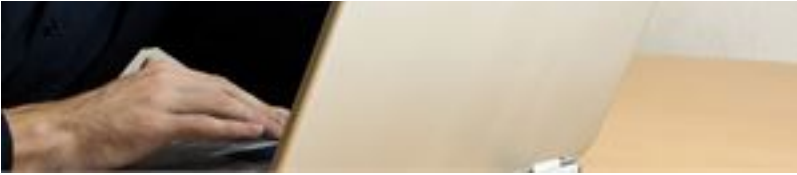
Youtubers Seeing Red After Recent Policy Changes