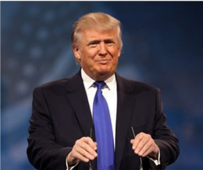
Trump Fails To Condemn White Supremacists In Charlottesville