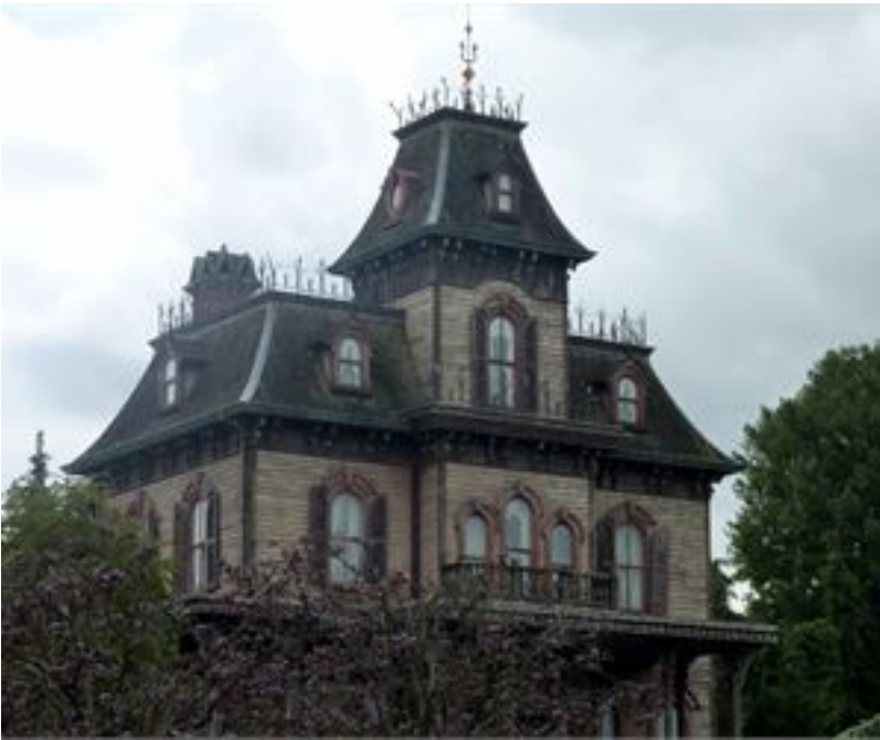
Haunted House Adventure